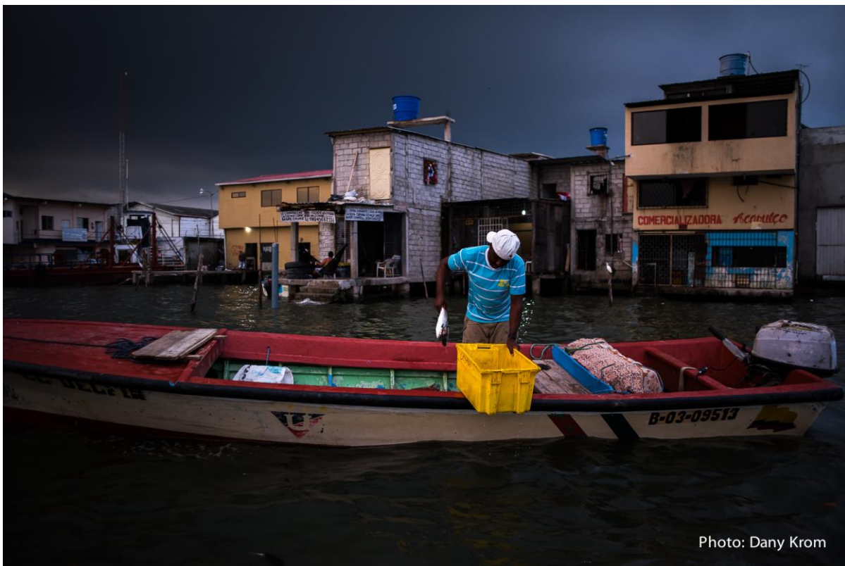
Figure 3. People whose livelihoods depend on small-scale artisanal fisheries in flood-prone coastal regions, such as the man shown here, are highly sensitive to the impacts of flooding (Machala, Ecuador, February 2016). Floods may reduce their financial capital and their adaptive capacity.