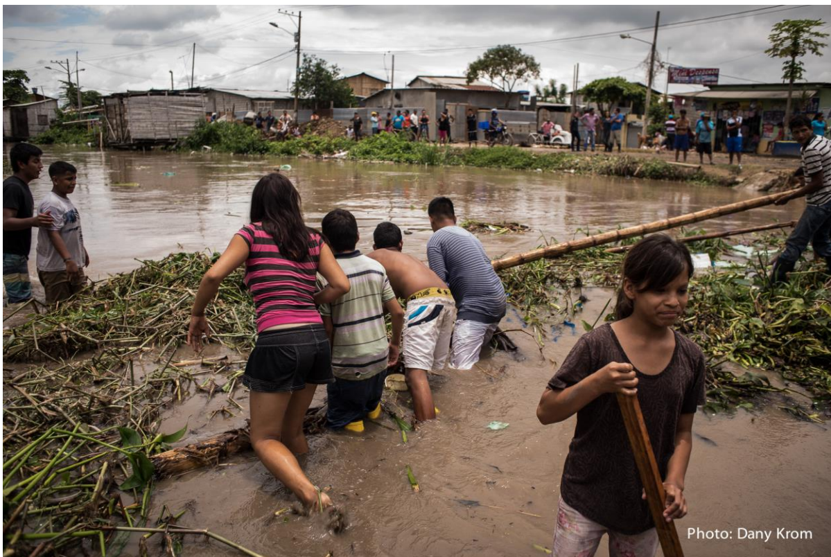
Figure 4. Community members work together to remove debris from a blocked canal on the urban periphery of Machala, during a major flood in 2016. Community leadership and social cohesion are key aspects of social capital, which affects their adaptive capacity.