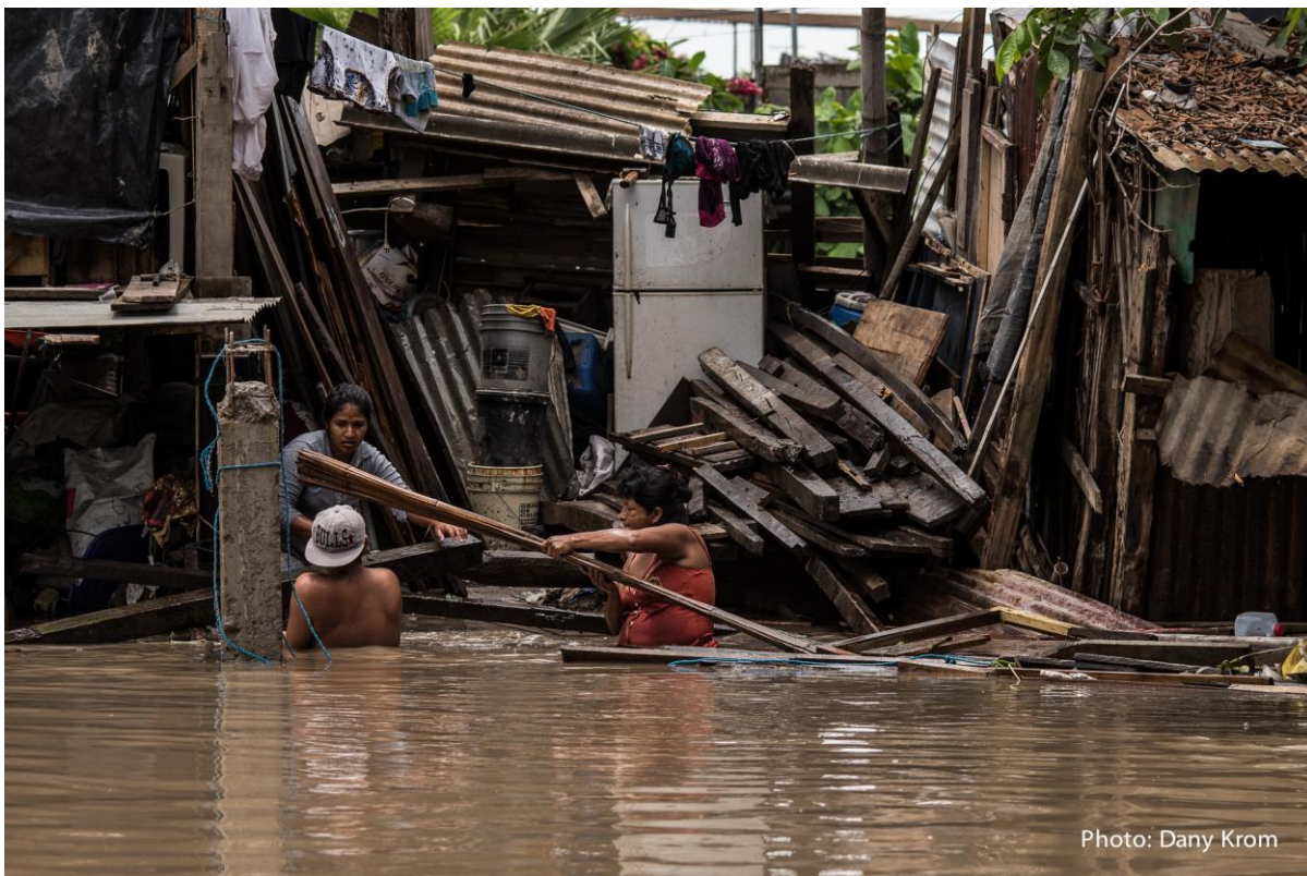
Figure 2. A family is shown evacuating during a major flood on February 26, 2016, when over 170 mm of rain fell in the coastal city of Machala, Ecuador, in 10 hours and coincided with high tides (Machala Soportó La Lluvia Más Fuerte Del Año | El Comercio n.d.). Machala is typical of cities in Latin America, which lack structured urban planning. Low-income neighborhoods in the urban periphery are exposed to flooding during extreme rainfall events in El Niño years, as shown here, and experience loss of property and livelihoods.

The hazard analysis provides the foundation for the development of an EWSF, allowing practitioners to strengthen surveillance of flood events in key places and at the appropriate timescales. This analysis also allows the risk management sector to identify other sectors associated with the management of secondary hazards, such as the health sector.