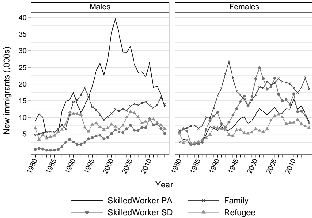
Figure 2: Smaller and more recent admission classes, Adult Arrivals