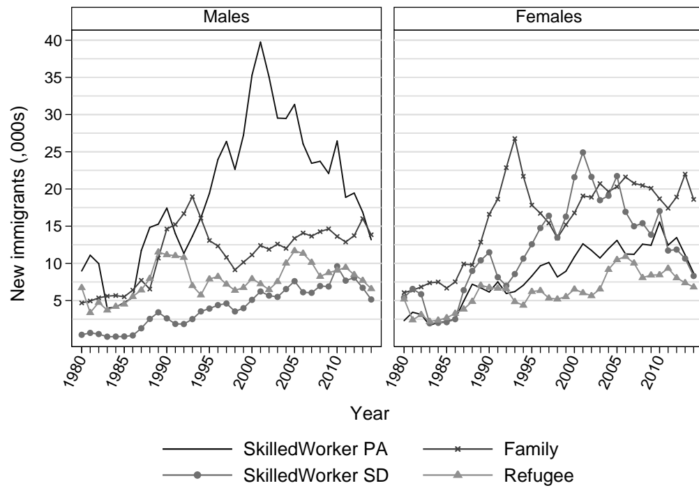
Figure 2: Smaller and more recent admission classes, Adult Arrivals