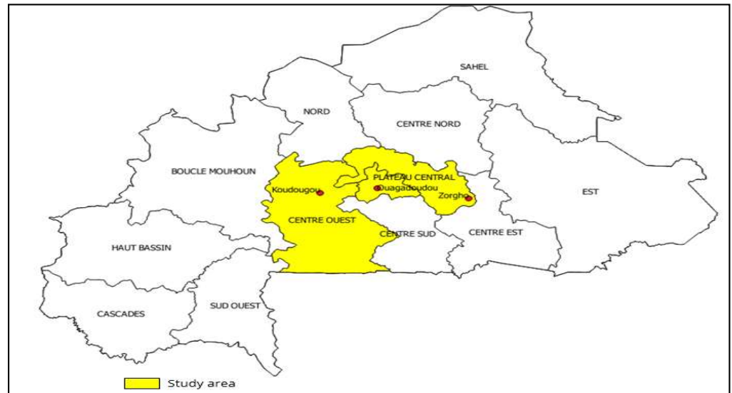
Figure A1: Census Villages