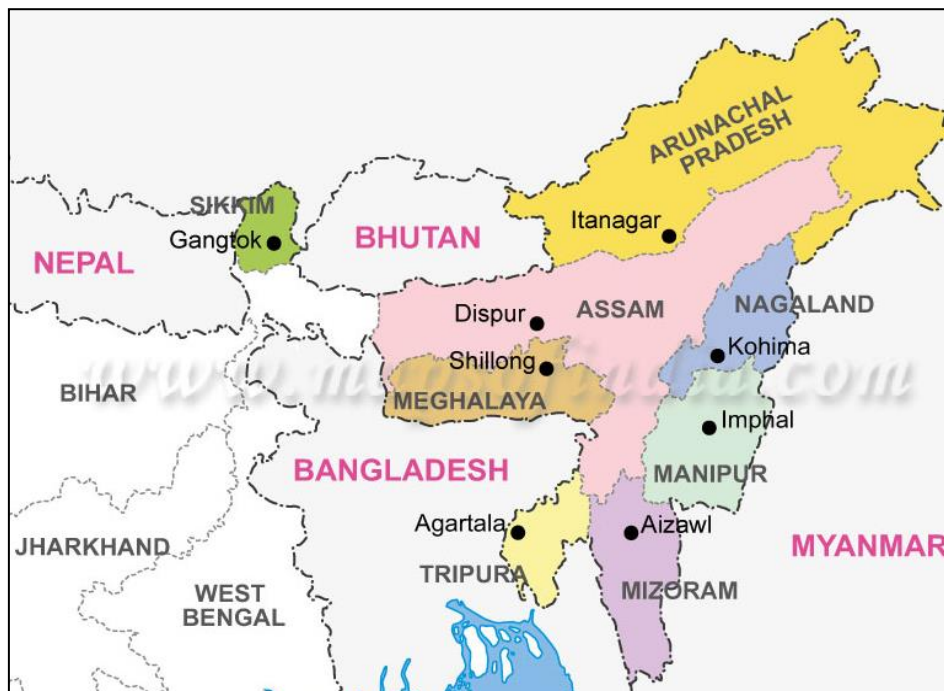
Map: India's Northeast States and the Bordering Countries

The process of designing protocols for the implementation of the MVA in the BBIN sub-region is underway and to this end, governments are actively engaging with stakeholders to gather feedback on the design of the protocols. It is therefore, vital that there should be adequate representation of women entrepreneurs and small-scale traders in these consultations so that their interests and requirements are considered before finalising the protocols and policies. Moreover, the domestic policy measures taken by each country can further be integrated into a synchronized regional agenda for gender responsive trade facilitation measures.