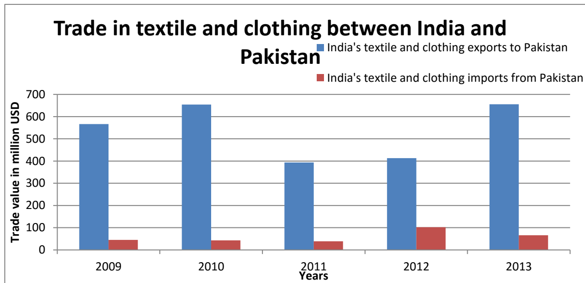
Figure 3: Trade in Textile and Clothing between India and Pakistan (2009-2013)