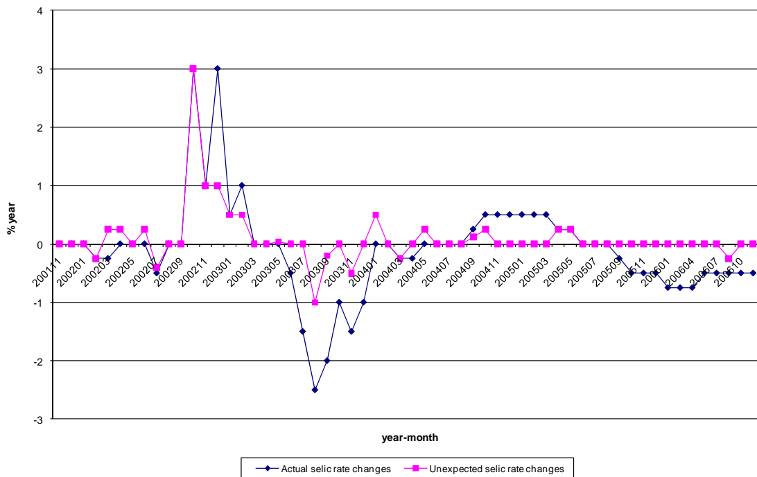
Figure 2: Actual x Unexpected changes in selic rate

Tables 2 and 3 have pairwise correlations between changes in lending interest rate and Selic (unexpected and actual), and changes in new loans and Selic (unexpected and actual). Correlations suggest that it takes two days for changes in the basic rate to affect lending rates and quantities: three and four days after the meeting the correlation between