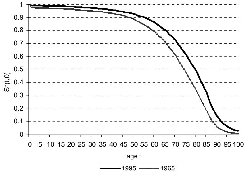
Figure 2: Survival Probabilities for the U.S. Population (from age 0 to t ), 1965 and 1995

Of the parameters and variables needed, some are common in the “value of life” literature. First, interest rates are assumed to be 3% per year, and this number is used to calculate the discounted survival functions ( S(t, a) ). The assumption of subjective rate of time preference equal to the interest rate implies constant consumption throughout life. Since we are not interested in life-cycle considerations, and this facilitates the empirical implementation of the model, it is the best way to proceed. This allows the consumption term in the willingness to pay expressions to be factored as (\varepsilon_c^{-1} - 1) c \int_i^\infty S_\theta(t, i) dt . Consumption is set to the 1965 value of total per capita consumption ($13,835, equal to private plus government consumption in 1996 US$), obtained from the Federal Reserve Board Economic Database (FED). 13 Following Becker, Philipson, and