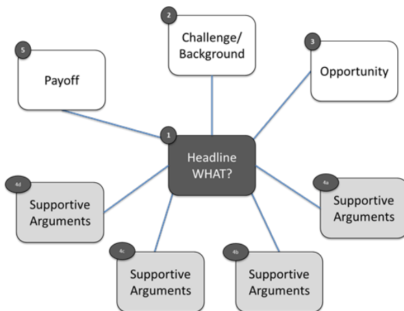
Fig. 2 Narrative map based on McCormack (2014) S.

communication scenarios, a lot of times an overload of information is created and people are often interrupted and distracted by other things so that knowledge creation is either limited or even inhibited. For these reasons McCormack (2014) suggests working with a tool called a “narrative map”. The idea is to present information and knowledge through a clearly structured, short and concise story.