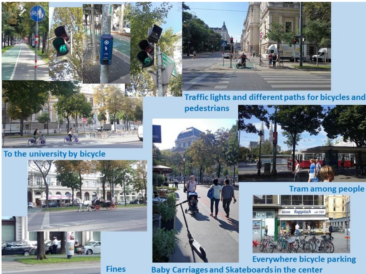
Fig.4 - Mobility and the diverse modalities (@Aragona, 2016)