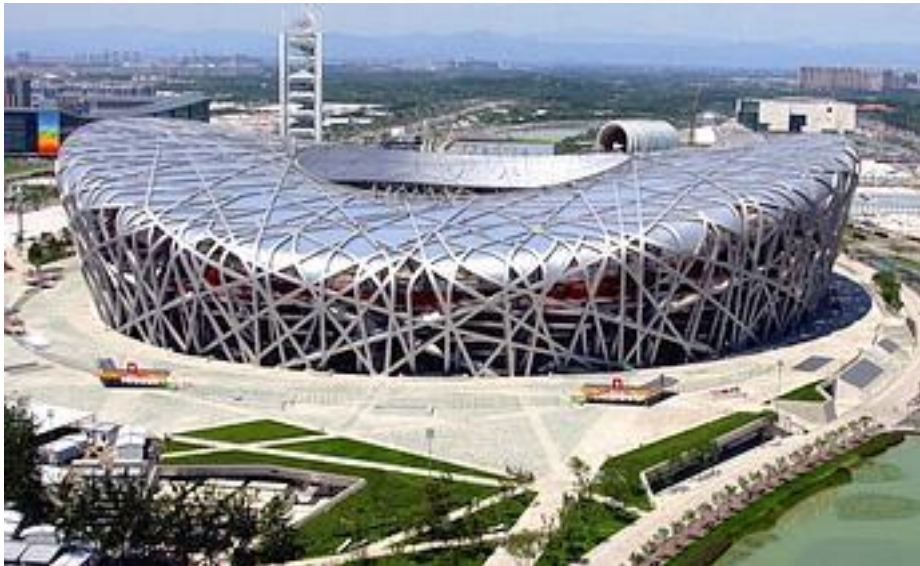
Fig.6 “The nest”, the stadium built for the Beijing Olympics Games (Sarcini, 2009)