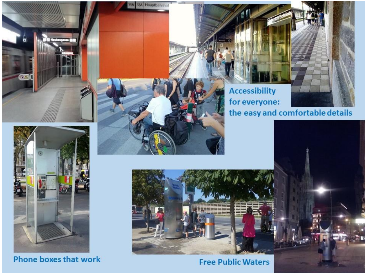
Fig.3 - Vienna, Austria, Accessibility and Public offers (@Aragona, 2016)