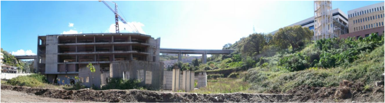
Fig.7 The ruins of the Student's House below the Faculty of Architecture, beside the river (“fiumara”) (@Aragona, 2014)

In Italy there is the unresolved issue of considering the territory and the right to build as “a natural right” and not given by the community, i.e. the state or the municipality. The law n.10/77 which replaced the building license with the building permit were declared unconstitutional in 1980. So the private but also the public, it is much freer than other European Nations. Free to put cement on the territory: “cementification” of it (fig.7). Except that the municipality decides to undertake a battle to prevent this 5 .