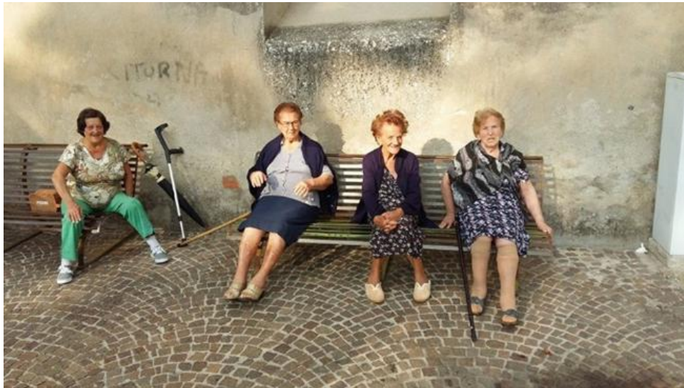
Fig.3 Old women in Torre Cajetani, a small village close to Fuggi, in the south of Lazio Region, Italy (@Ludovici, 2016))

etc.: they are replaced by punctual and / or exceptional interventions. In this picture, the elderly have not a policy dedicated to them (Fig.3), unless of the activities included in the Social Master Plan (Piano Regolatore Sociale) of the 1999 (Aragona, 2003a) that however have a “defensive” character that is of “remedy” and not structural.