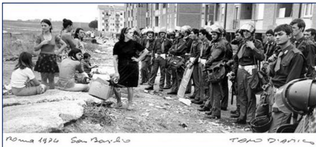
Fig.1 - Fight for the house, 1974, San Basilio, Rome North East (@D'amico)

The issues of happiness and well-being of the citizens are central in the work of urban planners and land planners. The Athens’ Charter drawn up in the 30s of '900 was created with these objectives. In the biggest towns the most of population lives in the peripheral areas (fig.1).