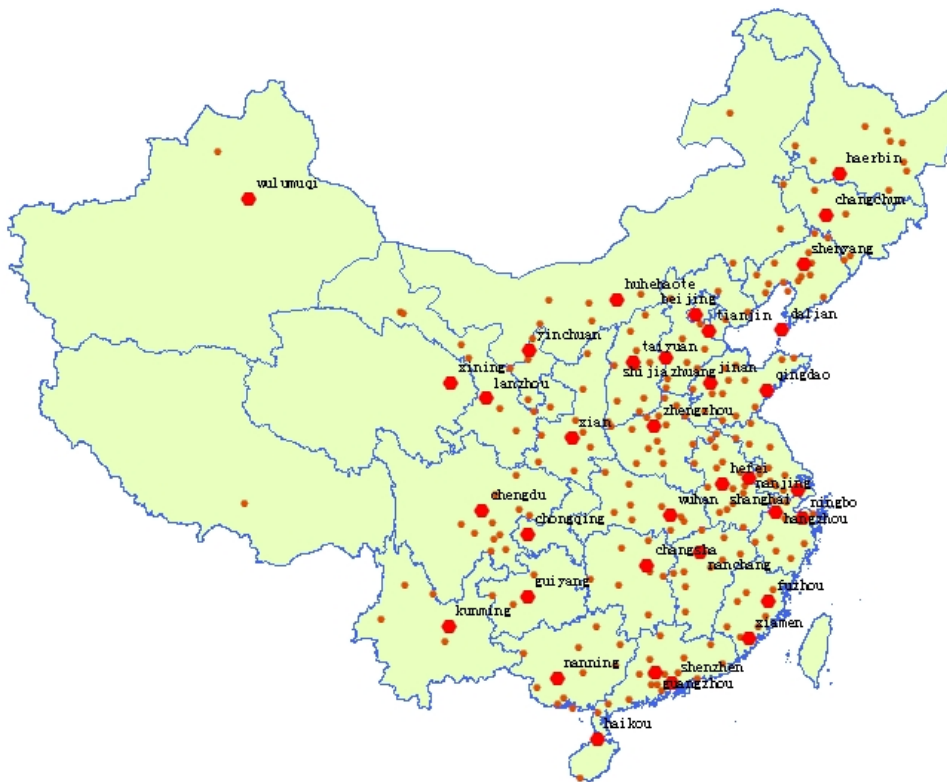
Figure 1. 255 Cities of prefecture level or above in China in 2007