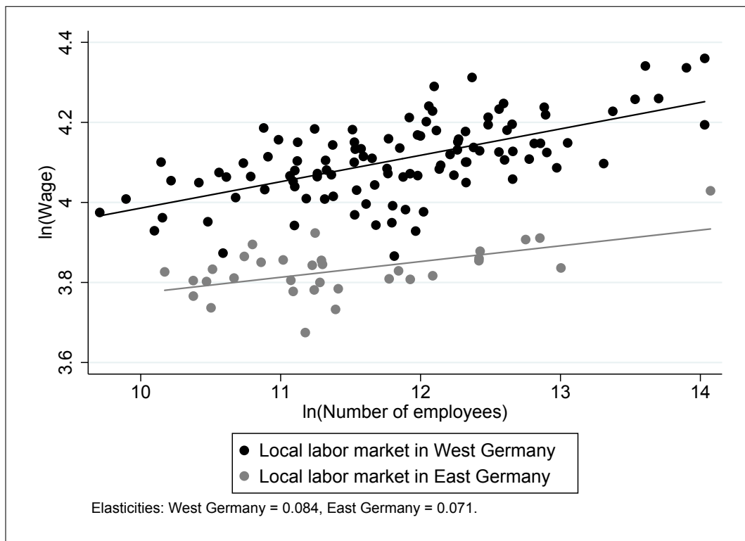
Figure 1: Local labor market size and regional wages.

There is extensive empirical evidence that wages in large local labor markets are significantly higher than wages elsewhere. Figure 1 illustrates disparities in regional wages for Germany. The difference between the largest local labor markets and the smallest amounts to almost 40 percent. Similar significant disparities are observed for other countries; see, e.g., Glaeser and Maré (2001) for the U.S. and Combes et al. (2008) for France. This raises the question, why firms in agglomerations 1 pay high wages and do not relocate to regions where labor is cheaper. 2