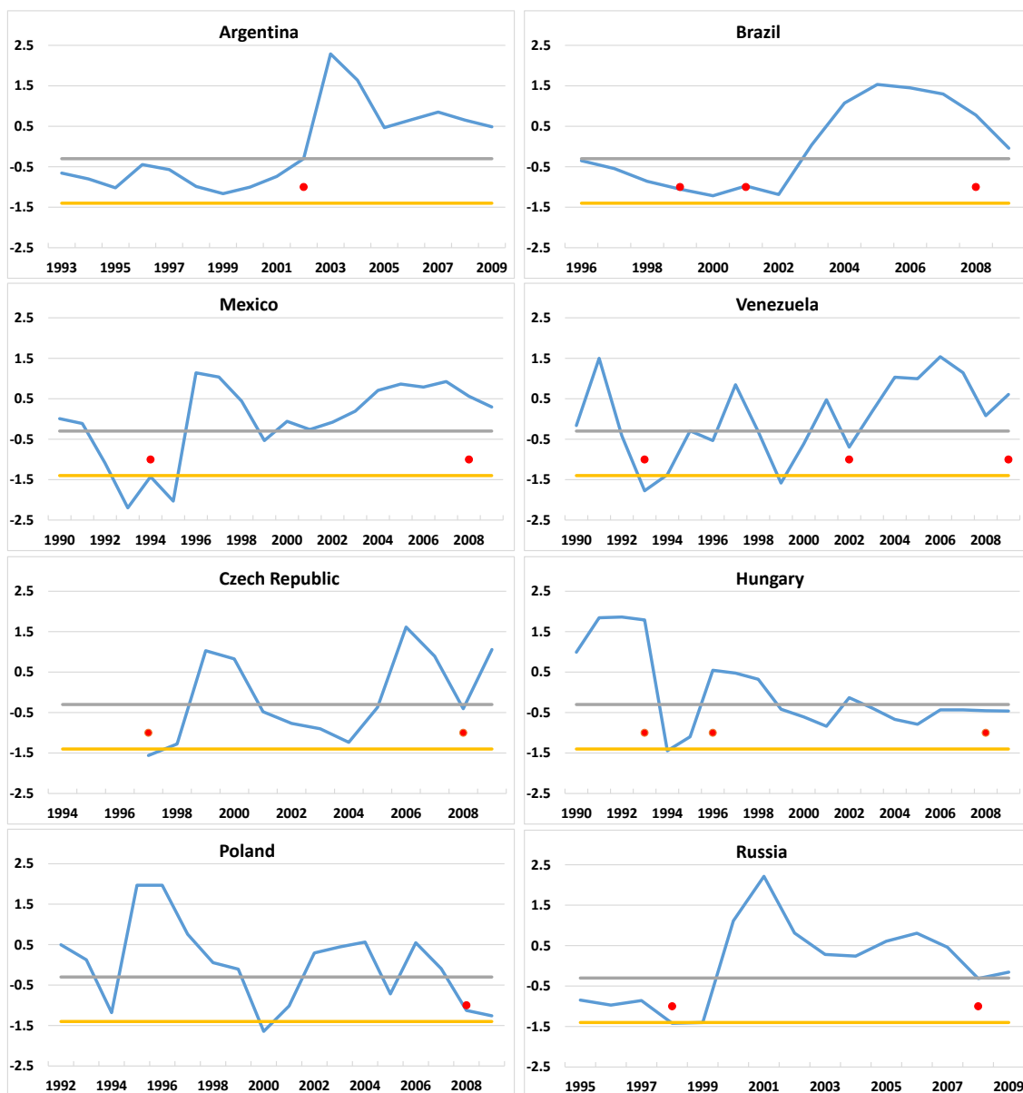
Figure 3: Signal approach for the current account balance to GDP ratio.

Notes: This figure shows the signal approach for the current account balance as a percentage of GDP for eight countries from 1990 to 2009. The dots represent the realization of the binary variable that takes the value of 1 if there was a crisis and zero otherwise. The two horizontal lines represent the thresholds: the bottom line is the threshold of -1.4 and the top line is the threshold of -0.3 . The solid line is the standardized movement of the current account to GDP ratio, with a one-year lag.