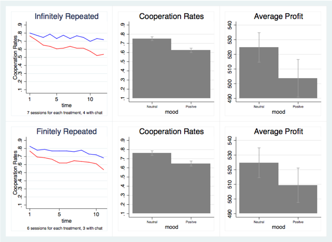
Figure 1: Cooperation Rates in the Different Treatments. The panels report the cooperation rates computed over observations in all neutral and positive mood sessions, aggregated separately for all different treatments. Only 1st super-games have been considered. Bands represent 95% confidence intervals.