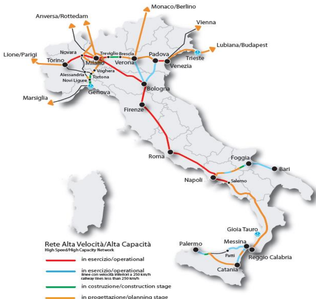
Figure 3. Italian High Speed railway network