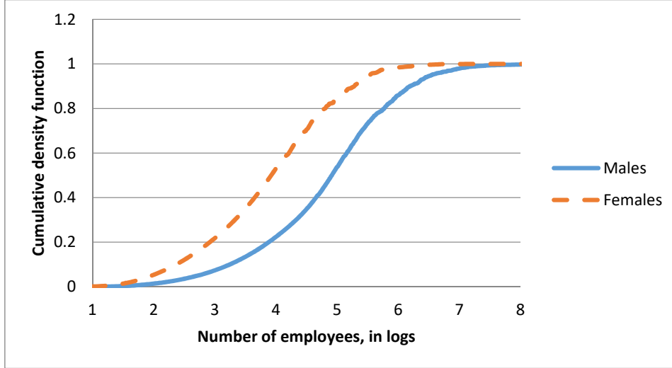
Figure 1: Firm-size distribution by gender