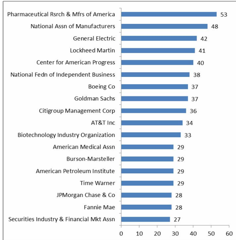
Figure 1. Top revolving door employers in the US.