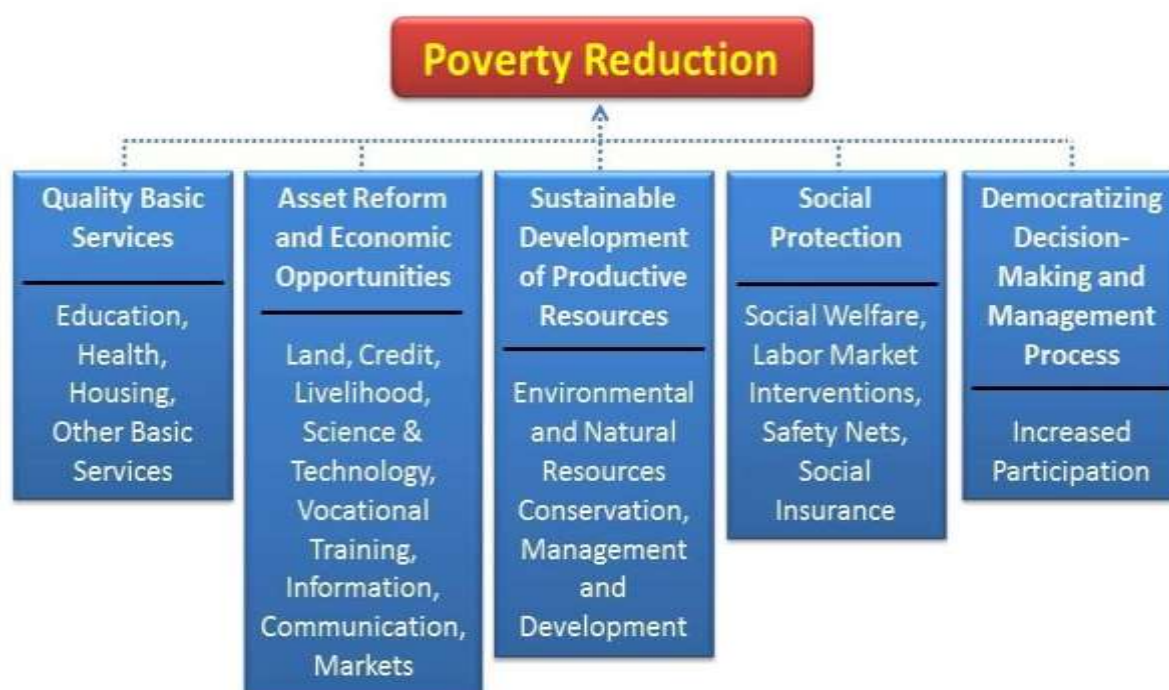
Figure 2. Enhanced Analytical Framework for Poverty Reduction

NOTE: Analytical framework taken from RA 8425, Social Reform and Poverty Alleviation Act was enhanced to include social protection.