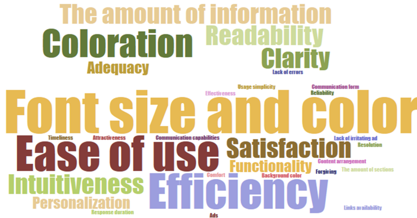
Figure 2: The cloud of the first branch factors produced by “nominal” groups

Mind maps gathered in the first session are briefly checked in order to eliminate those which are completely irrelevant with the main concept. Fortunately, all of them were positively verified and could be further taken into account. Next, we transfer answers to a spreadsheet. The rows are sorted alphabetically, and analyzed in order to merge synonyms or multiple versions of the same words (e.g. “color” and “coloring”, “intuitiveness” and “intuitive”). In such a manner, from 60 factors only 30 turn out to be distinct. Figure 2 below is an illustration of this set, using the “tag cloud” visualization technique.