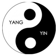
Fig. 1. Yin Yang as a symbol of paradox

Paradox: Contradictory yet interrelated elements that exists simultaneously and persist over time. Such elements seem logical when considered in isolation, but irrational, inconsistent, even absurd, when juxtaposed. Decision goal: identify a both/and solution that leverages synergies and distinction of the opposing elements