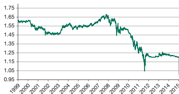
Figure 1 Swiss franc-euro exchange rates

However, the SNB strategy to maintain a weak Swiss franc turned out to be very costly. Between September 2011 and December 2014, the SNB had to intervene several times in the currency market to purchase US dollars, euros, British pounds and Japanese yen and sell Swiss francs (Figure 2). In the end, these interventions exploded the foreign currency reserves of the SNB from CHF 264 billion in September 2011 to CHF 541 billion in December 2014 (see Figure 3). This corresponds to more than 80 per cent of the 2014 Swiss GDP of about CHF 650 bil-