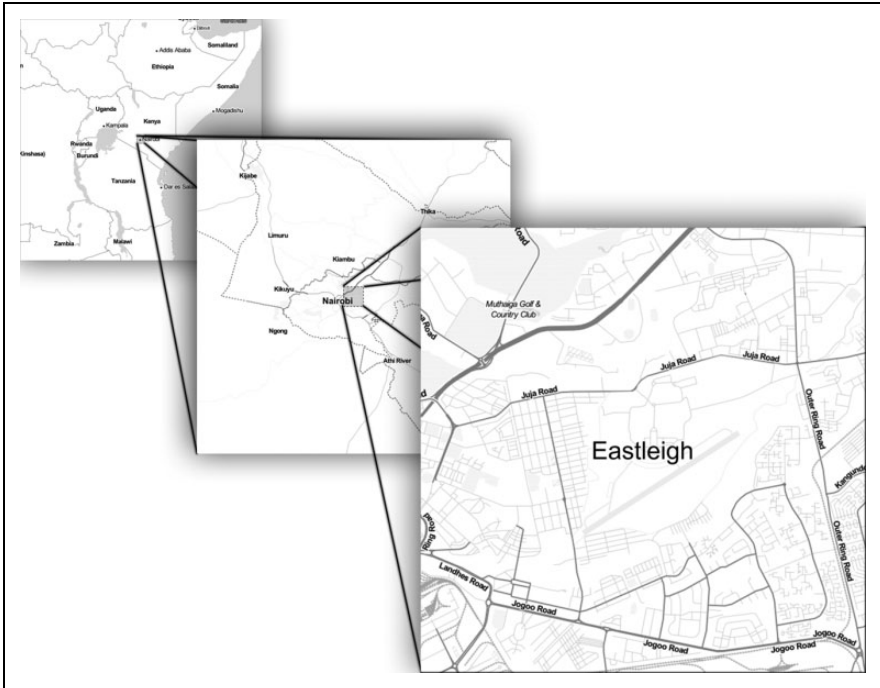
Figure 1. Location of Eastleigh.

enumerators, all of whom were local Eastleigh residents, consisted of eight individuals balanced by gender and religion.