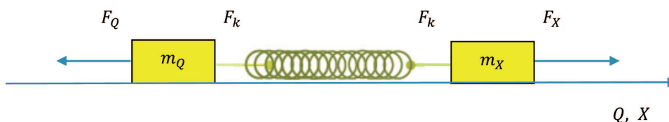
Figure 1: A simple spring system.

zero. The masses have initial velocities \dot{X}_0 and \dot{Q}_0 towards the direction of the symmetry axis. Moreover, m_X is drawn by force F_X and there is dragging force -F_Q affecting m_Q . Figure 1 illustrates the setup. The forces are, according to Hooke's law,