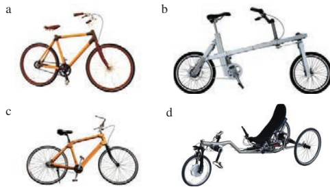
Figure 1 (a) Bamboo bicycle; (b) Do-It-Yourself bicycle; (c) Wooden bicycle; (d) Smart Urban Wheeler concept

sustainable product development, manufacturing and business practices for cycling options. To that end, the CRC 1026 demonstrated interdisciplinary innovative solutions in the field of sustainable value creation for mobility, specifically for cycling. In parallel with the main theme of showing how sustainable value creation ensures economic wealth, environmental integrity and quality of life, different CRC projects contributed to the development, manufacturing, business modelling and end-of-life management studies for cycling products and services. Some of the physical prototypes of developed products are displayed in Figure 1.