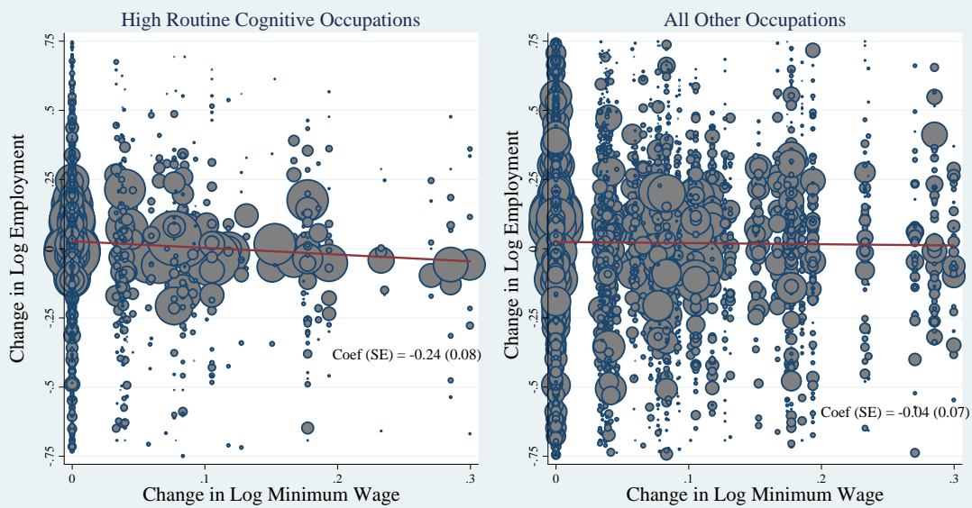
Figure 2: Employment Effect of a Minimum Wage Hike High Routine Cognitive Occupations vs. All Other Occupations in Wage Group 1

Note: See notes to Figure 1. Wage Group 1 includes all occupations where the average wage to the minimum wage within a state is less than 1.75. A high routine cognitive occupation has a routine cognitive share that is more than one standard deviation above average.