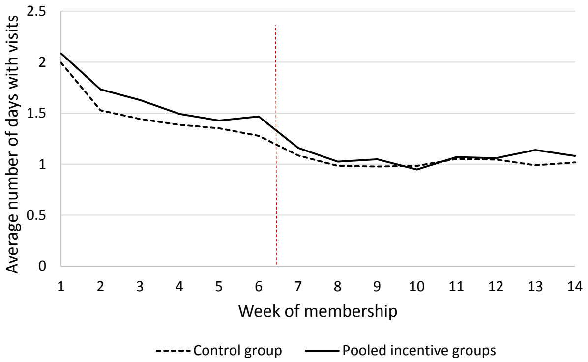
Figure 1a. Visit Rates Control vs Pooled Incentive Groups