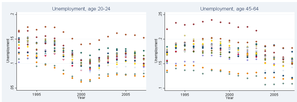
Figure 2: Trend in county-level employment rates

Notes: The figures show the average county-level unemployment rates over time by age group.