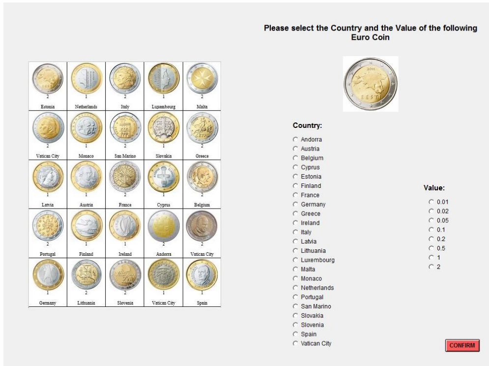
Figure 1: The Coin Task

Johnson, 1990). The chosen threshold is low in order to avoid losing observations because subjects do not earn a positive amount.