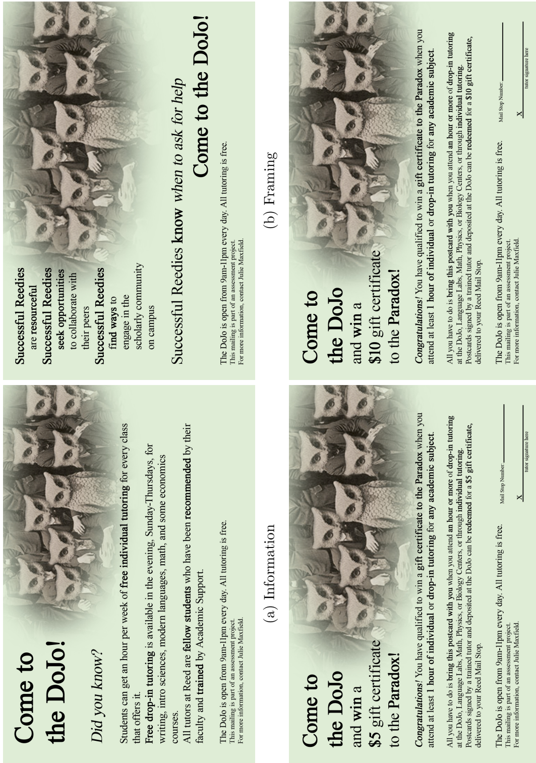
Figure 1: Postcards for each treatment arm

Note: “The DoJo” refers to the main campus tutoring center, located in the Dorothy Johansen House. The Paradox, referenced in postcards (c)-(d), is the campus coffee shop.