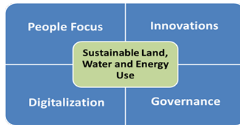
Figure 2: Key policy action areas