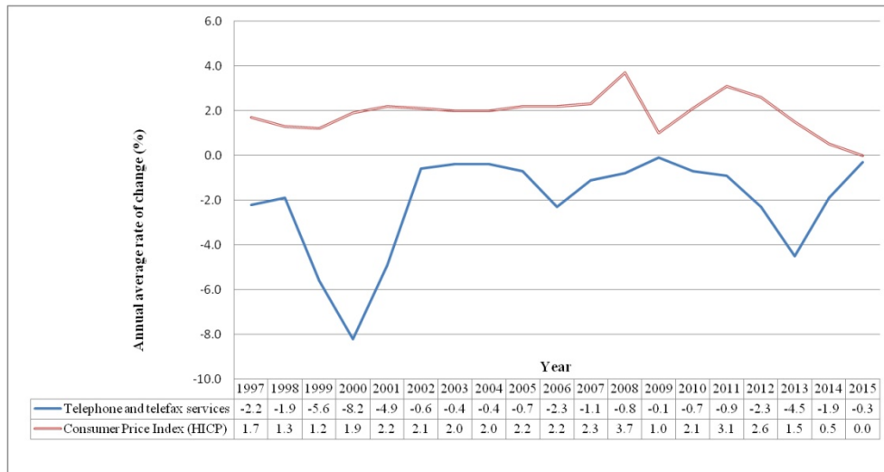
Figure no. 2: Consumer prices and prices for telecommunications services in Europe 1

reduce their prices within all these years. Without the regulatory pressure, these positive effects for consumers would not have been possible.