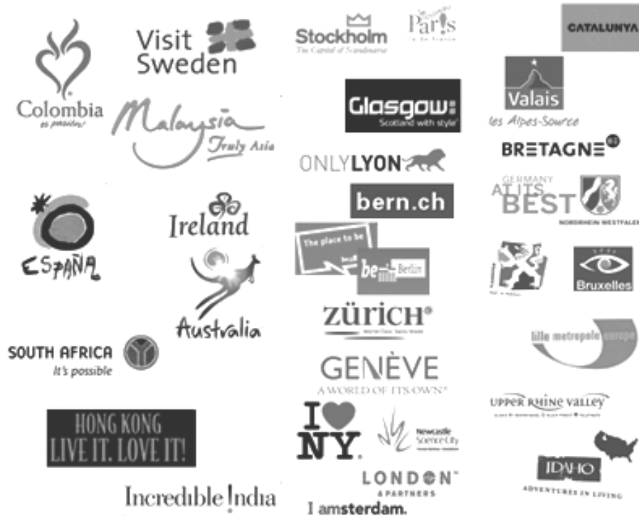
Figure no. 2: Examples of place brands, at various observation scales

structure "Lion's Mound" was William I's (first Dutch king) intention to mark the place where his son, William II fell off the horse, having a shoulder injury from a musket shot in the same Battle of Waterloo 1815 , and the Bicentennial with the idea of economic revival through cultural events (battle commemorations) of a place actually without any other development potential - they can be currently harmonised under the form of a single "story" of the place, to work for one idea, for one image - the "Waterloo" brand.