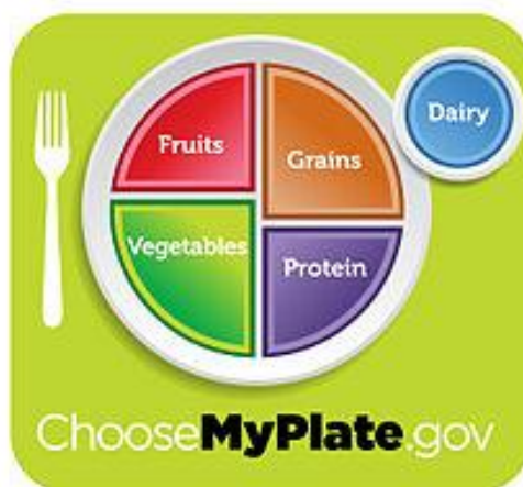
Figure no. 3: “MyPlate” Symbol

The newest American model of healthy eating, illustrated by the symbol „ MyPlate ”, includes five food groups, able to provide for the young consumers' diet all the necessary nutrients, without having a higher caloric intake (Figure no. 3).