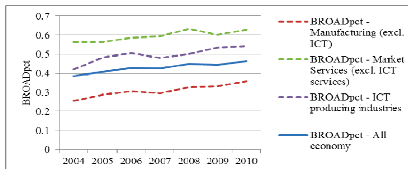
Figure no. 2: ICT use as measured by proportion of broadband-enabled employees, by industry (Slovenia, 2004-2010)

ICT use in this same period has also strengthened (Figure no. 2). Whereas in 2004 38 % of employees had access to fast internet on average, if we look at the whole economy, by 2010 this proportion has increased to 46%. Again, the level of ICT use as measured by this variable is, not surprisingly, the highest in services sector, whereas the manufacturing sector is least intensive in ICT use.