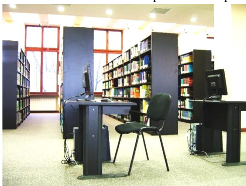
"Paul Bran" Reading room

Consequently to the partial or total accomplishment of these programs the educational process of ASE provided training for 20000 students, enrolled at day, evening, no frequency, and in depth study programs, more than 800 students of postgraduate programs, more the 1000 students for permanent formation programs, above 100 students for MBA type academic programs, and 700 PhD students. The training support for students was developed by both issuing new handbooks – at that time more than 70% of the disciplines had handbooks issued by ASE or by specialized publishers – and increasing the study area of libraries to around 3000 sq m and 1200 places. It should be mentioned the fact that in the