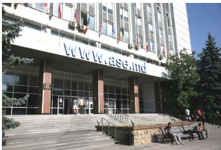
The Academy of Economic Studies of Moldavia, Building A, Chişinău