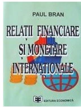
Book issued by the Economică Publishing, Bucharest , for the use of students and professionals