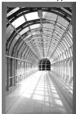
„The Bran passage” – gangplank between „Ion N. Angelescu” building and „Mihai Eminescu” building of ASE Bucharest

documentation; application of dynamic and performing management in administration, accounting, human resources, chairs, dean's offices, senate's bureau, student organizations etc.; securing a global financial balance throughout the entire duration of the mandate.