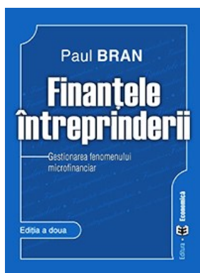
Finances of the enterprise, issued by the Economică Publishing , Bucharest in more editions