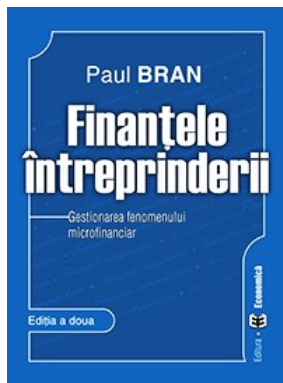
Finances of the enterprise, issued by the Economică Publishing, Bucharest in more editions