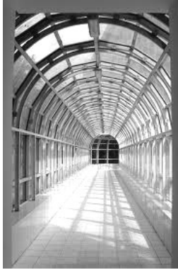
„The Bran passage” – gangplank between „Ion N. Angelescu” building and „Mihai Eminescu” building of ASE Bucharest

documentation; application of dynamic and performing management in administration, accounting, human resources, chairs, dean's offices, senate's bureau, student organizations etc.; securing a global financial balance throughout the entire duration of the mandate.