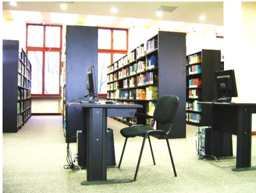
“Paul Bran” Reading room

Consequently to the partial or total accomplishment of these programs the educational process of ASE provided training for 20000 students, enrolled at day, evening, no frequency, and in depth study programs, more than 800 students of postgraduate programs, more the 1000 students for permanent formation programs, above 100 students for MBA type academic programs, and 700 PhD students. The training support for students was developed by both issuing new handbooks – at that time more than 70% of the disciplines had handbooks issued by ASE or by specialized publishers – and increasing the study area of libraries to around 3000 sq m and 1200 places. It should be mentioned the fact that in the