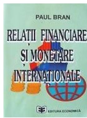
Book issued by the Economică Publishing , Bucharest, for the use of students and professionals