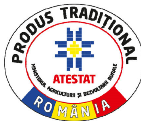
Figure no. 1. Logo of a traditional attested product

In order to regulate the traditional products market, the Ministry of Agriculture and Rural Development (MARD) has elaborated together with the National Authority for the Protection of Consumers (NAPC) and the Ministry of health, the project of an order which will attest the traditional products, which may be put into practice by the end of the year 2013. This order project has entered public debate at the date of 30 July 2013 according to the internet page of the MARD. According to this order the traditional products will be marked with a national logo which will be in the exclusive property of the Ministry of Agriculture and Rural Development (Figure 1).