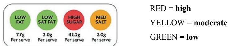
Figure no. 3: "Traffic Light" System

The FOP labelling system, which uses colour coding of traffic lights, warns consumers about the high (red), moderate (yellow) or low (green) content of undesirable nutrients in foodstuffs (total fat, saturated fat, sugars and salt) (Fig. no. 3). The criteria for assigning the colour code were determined by the FSA (Borgmeier and Westenhoefer, 2009).