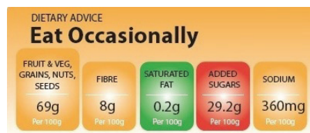
Figure no. 5: Exemple of label: “Healthy Eating System”

In addition, the "Healthy Eating System" includes a general dietary advice for consumers, which may result in: "eat often", "eat occasionally" or "eat sparingly". These recommendations are based on nutritional criteria imposed by FSANZ (Food Standards Australia & New Zealand).