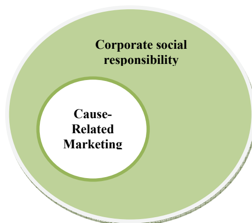
Figure no. 1: Cause-related marketing, part of social responsibility

In the UK, the Business in the Community (BITC) organization has been actively involved in working to improve standards in responsible business practice since its inception in 1982. Its member companies are committed to using best practice in order to make a more positive impact on society, and this takes the form of specific initiatives including cause-related marketing campaigns as well as considering the wider aspects of corporate social responsibility. Business in the Community (2004) defines cause-related marketing as: " A commercial activity by which business and charities or causes form a partnership with each other to market an image, product or service for mutual benefit. "