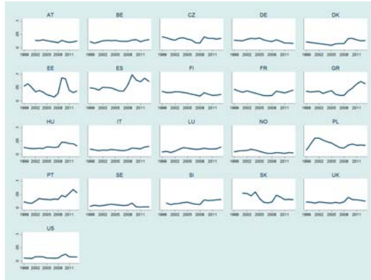
Figure 3: Annual transition rate from employment to unemployment by country, 1999 – 2013

Notes: See Figure 1 for the country codes. Source: EU-LFS, CPS, own calculation.