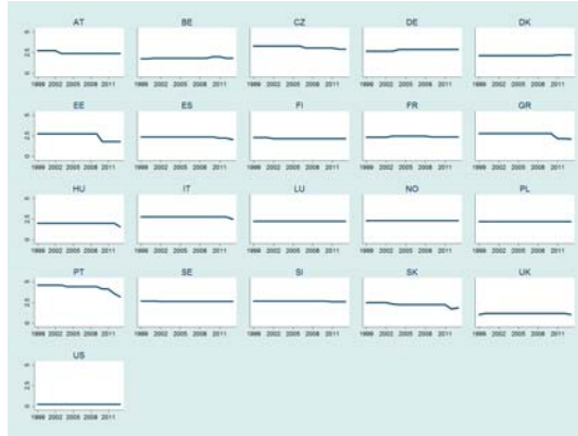
Figure 5: Employment protection legislation by country, 1999 – 2013

Notes: See Figure 1 for the country codes.