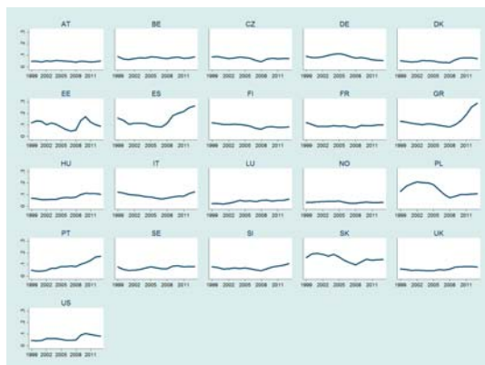
Figure 2: Unemployment rate by country, 1999 – 2013

Notes: See Figure 1 for the country codes.