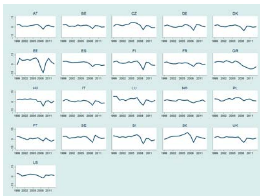
Figure 1: Annual GDP growth by country, 1999 – 2013

Notes: Country codes: AT: Austria, BE: Belgium, CZ: Czech Republic, DE: Germany, DK: Denmark, EE: Estonia, ES: Spain, FI: Finland, FR: France, GR: Greece, HU: Hungary, IT: Italy, LU: Luxembourg, NO: Norway, PL: Poland, PT: Portugal, SE: Sweden, SI: Slovenia, SK: Slovak Republic, UK: United Kingdom, US: United States of America.