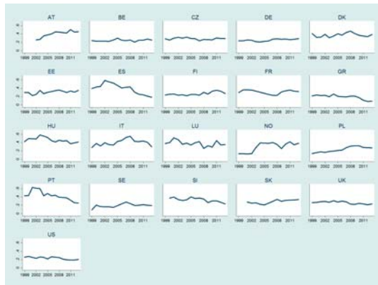
Figure 4: Annual transition rate from unemployment to employment by country, 1999 – 2013

Notes: See Figure 1 for the country codes.