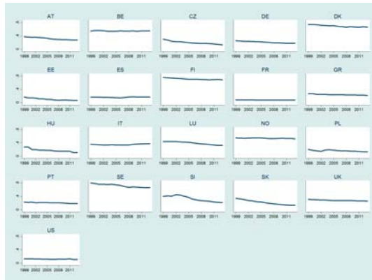
Figure 6: Union density rate by country, 1999 – 2013

Notes: See Figure 1 for the country codes.