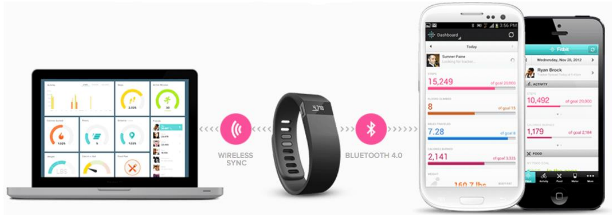
Figure 2. Personal informatics device used in this study

QoS parameter scale composed of nine parameters. We used the ITU's mean opinion score (ITU, 2011)—an ordinal scale assessing quality on a 5-point scale from 1 (worst) to 5 (best).