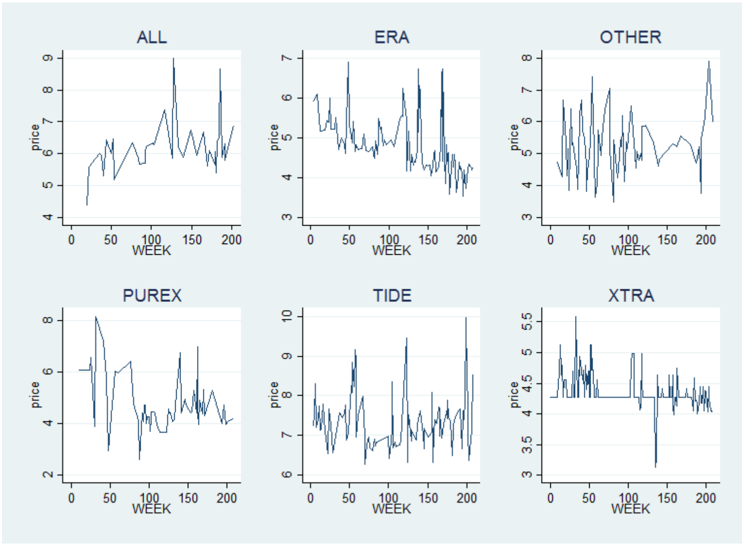
Figure A.2: Price Series 200-Ounce Packs Price development over sample period across stores.