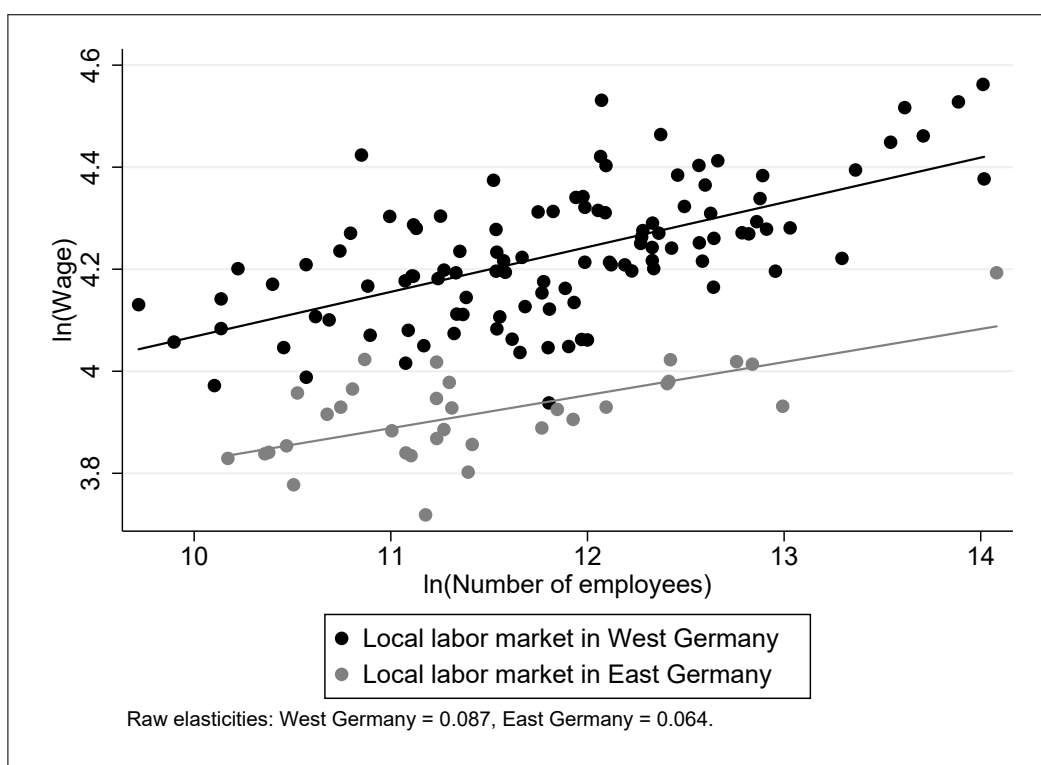
Figure 1: Local labor market size and regional wages

Note: The figure refers to average regional wages that are paid at the beginning of new employment relationships starting in 2011 and the size of regional labor markets in terms of number of employees subject to social security contributions.