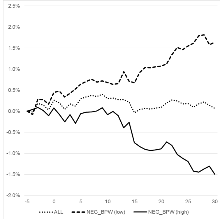
Figure I. CARs following the AGM by high vs. low NEG_BPW

This figure shows cumulative abnormal returns (CARs) across all CEO speeches as well as segregated by a median split on NEG_BPW. The speeches' negativity and the abnormal returns are estimated as described in Appendix I. Abnormal returns are cumulated from 5 days before the annual general meeting (AGM) until 30 days after the AGM. CARs are shown in percent.