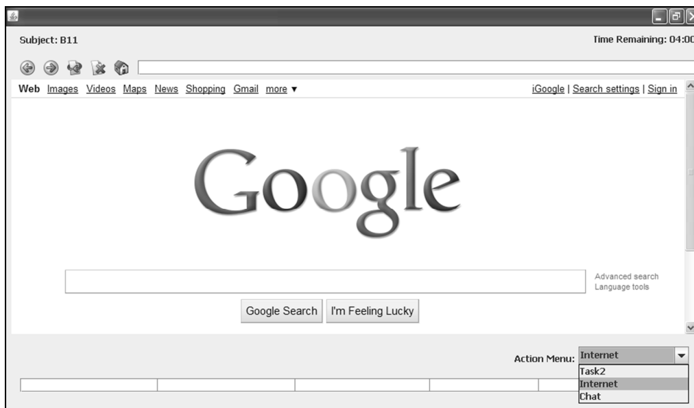
Figure 2. Embedded Internet screen.