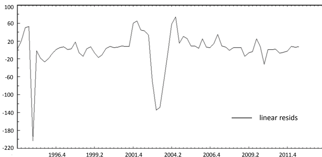
Figure 2. Residual plot from Equation (2).

At first sight, Equation (1) seems to fit the Brazilian actual policy rule remarkably well. However, it is interesting to note that there are large residual spikes for more than one period notably in 1995–1996, 2002–2003, 2008–2009 and 2010–2011. The fitted interest rate is, over these time intervals, correlated and remarkably different from the actual value.