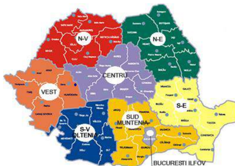
Fig.1- The number of agrarian cooperatives in Romania by development region

After analysing public data, centralizing the result at a region level, in 2014 compared to 2009, a drastic decrease in the number of agrarian cooperatives and agrarian associations operating in Romania has been found.