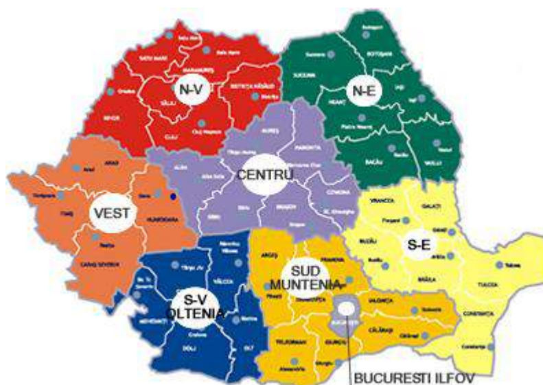
Fig.1- The number of agrarian cooperatives in Romania by development region

After analysing public data, centralizing the result at a region level, in 2014 compared to 2009, a drastic decrease in the number of agrarian cooperatives and agrarian associations operating in Romania has been found.