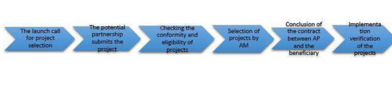
The process of granting preparatory support