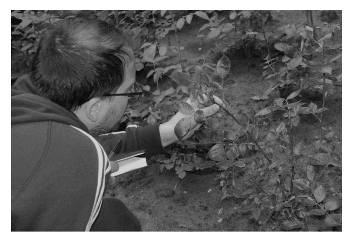
Fig. 2 – Notes refering to Ardis brunniventris Htg. attack (Kiseleff park)

The attack frequency (F%) was determined following the form: F\% = \frac{nx100}{N} where: