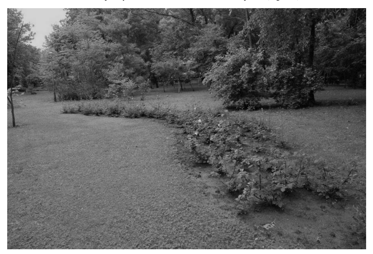
Fig. 1 – Rose rabate (Kiseleff park)

Notations were made on the frequency of attacks on shoots in the tested options (Figure 2).