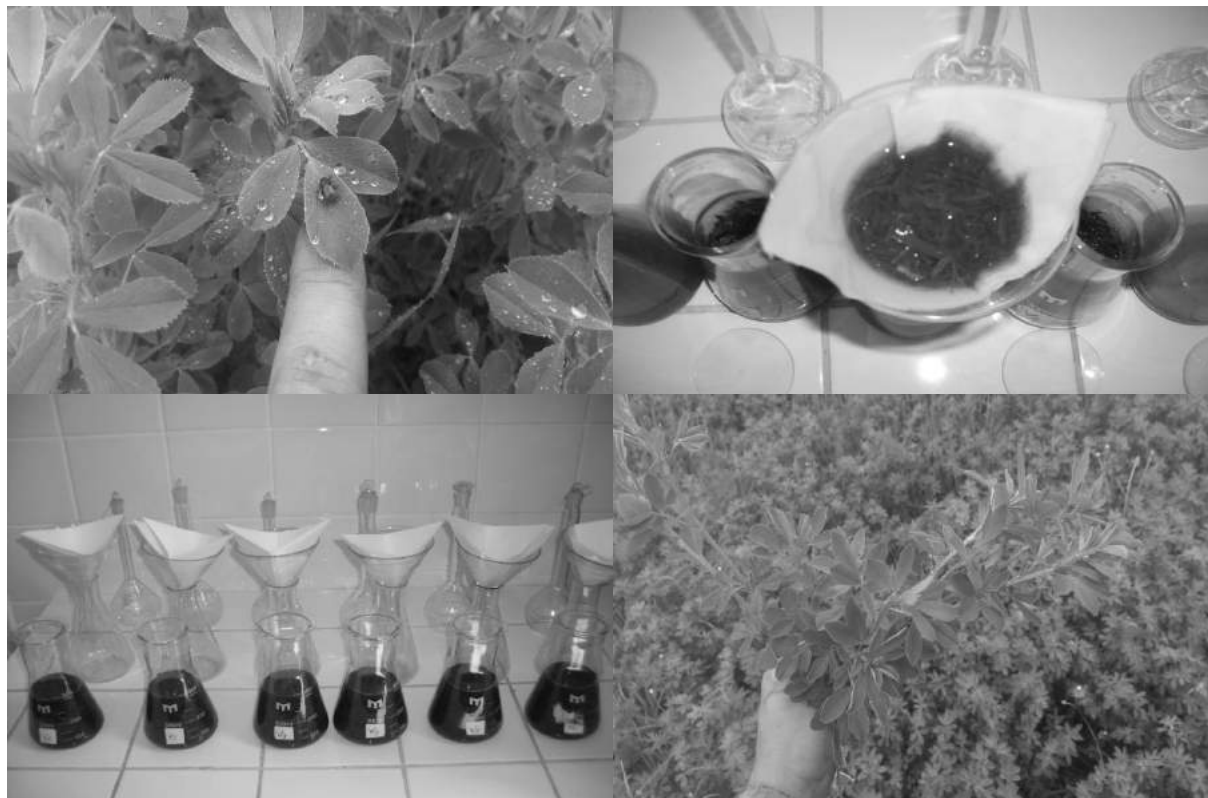
Figure 2. Medicago sativa harvest plants for making determinations Source: own results

From the results obtained after determinations it was found that the higher percent of protein is in the leaves harvested at the end of blooming (22.32%), which leads to the assumption that the harvest of Medicago sativa leaves in this period is very good, so that they can be used at their maximum yield both as food and medicine. The vitamin C has significant values (292.49 mg of ascorbic acid) and the consumption of these leaves in green state is a new source of nutritive substances needed by our organism.