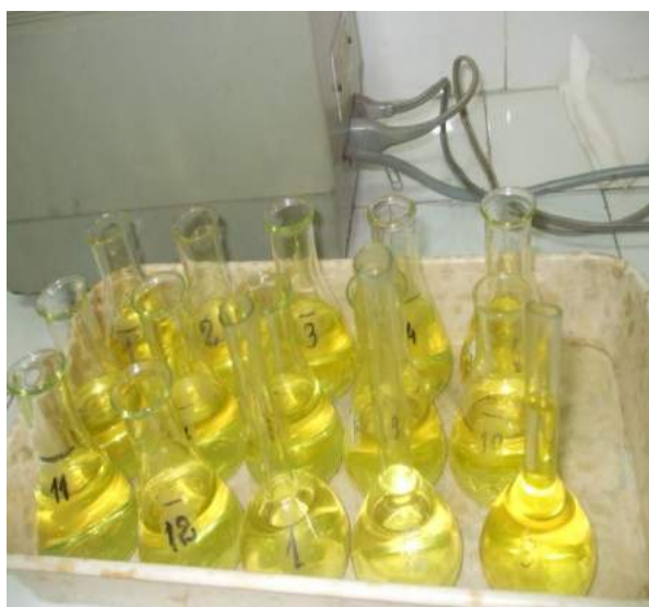
Figure 5. The extract used for determining the carotene