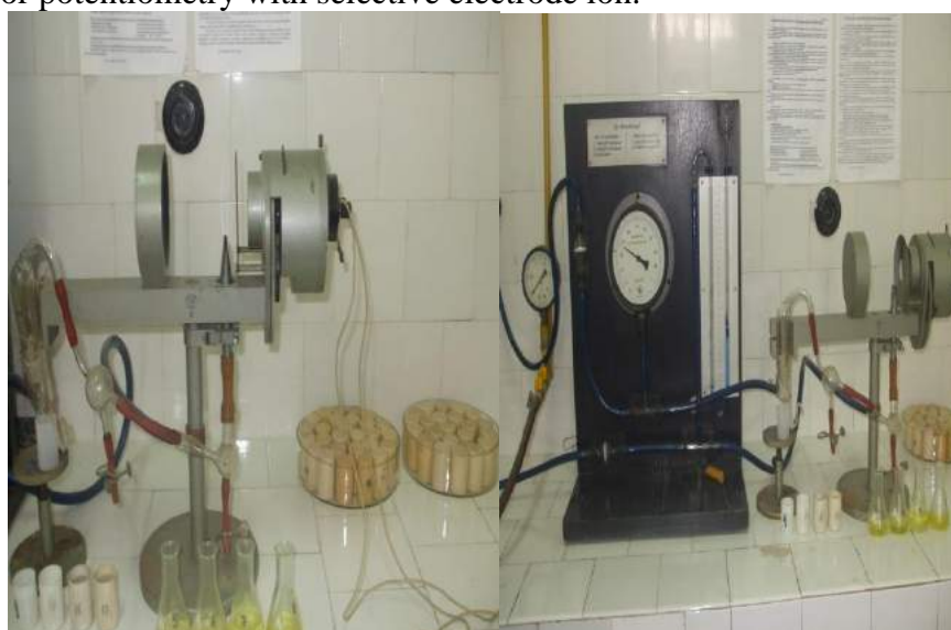
Figure 2. The extracts and the equipment used for determining K with flame photometer

The determination of K is made by calcination, and the dosage of K is made by photometry of flame emission or potentiometry with selective electrode ion.