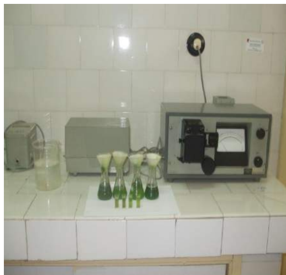
Figure 4. The sample reading at the photo-colorimeter