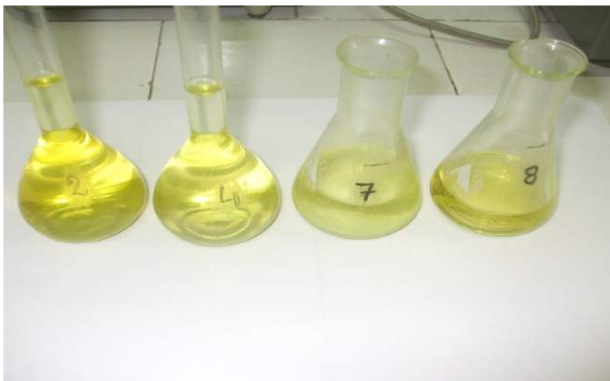
Figure 1. The determination of phosphorus from small elder plant

1 000 000 – the factor of transformation of micrograms in grams