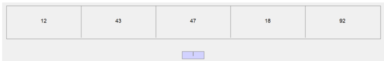
Figure 1: The experimental task

The general structure of our experimental design follows that of previous studies on this topic (compare e.g., Niederle and Vesterlund, 2007; Balafoutas and Sutter, 2012; Niederle et al., 2013) and consisted of four stages. In each stage, subjects had to work on a real-effort task, in which they had to add as many sets of five two-digit numbers as possible within 3 minutes (see Figure 1 for a screenshot). 4 The numbers were randomly drawn, and once the participant submitted an answer, a new problem appeared jointly with information on whether the former answer was correct or not. Participants were not allowed to use a calculator, but scratch paper was provided.